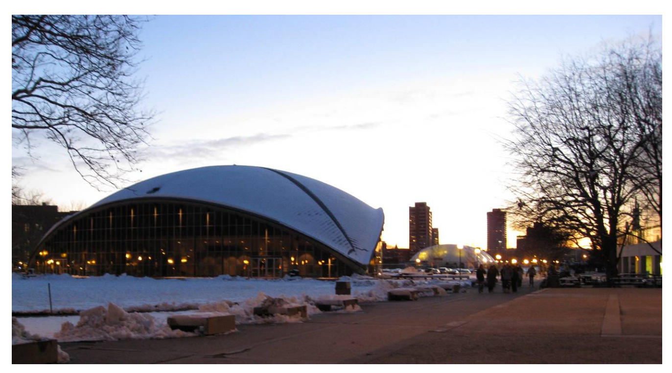
Might remember this one... slightly more snow than last time though...