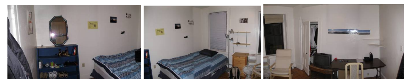
My room... still lacking flowers and liveliness ;-/.