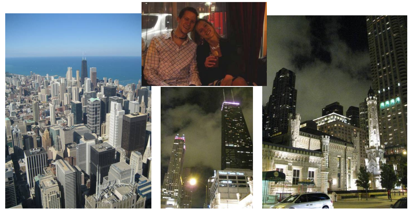
Austrian Science Talk 2008 in Gotham City. http://www.berndresch.com/pictures/0810_chicago/index.htm

Kick-off meeting in Cannes – good wine, good food, good mood. P.S.: observe the small helicopter on my yacht. http://www.berndresch.com/pictures/0809_cannes/index.htm