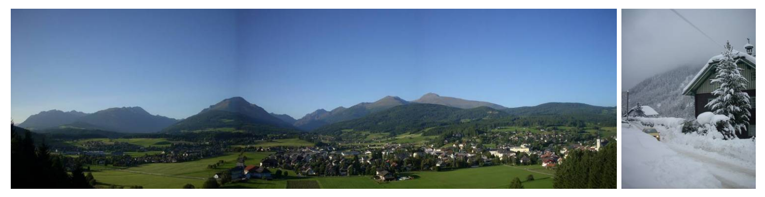
What can I say - home sweet home (left: September; right: December).