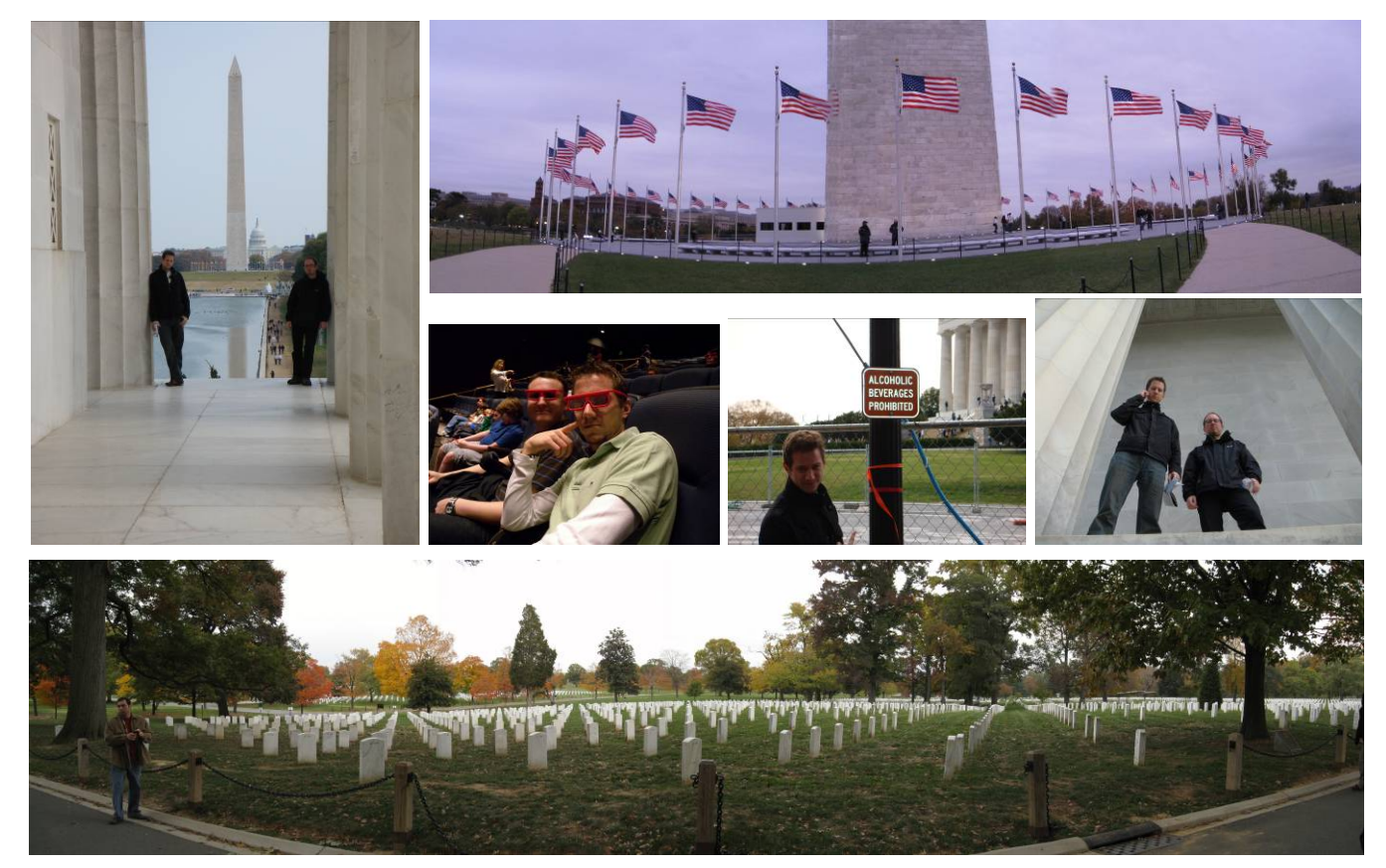
Washington – an amazing city! And amazingly dead (in terms of going out and social life). http://www.berndresch.com/pictures/0811_washington/index.htm