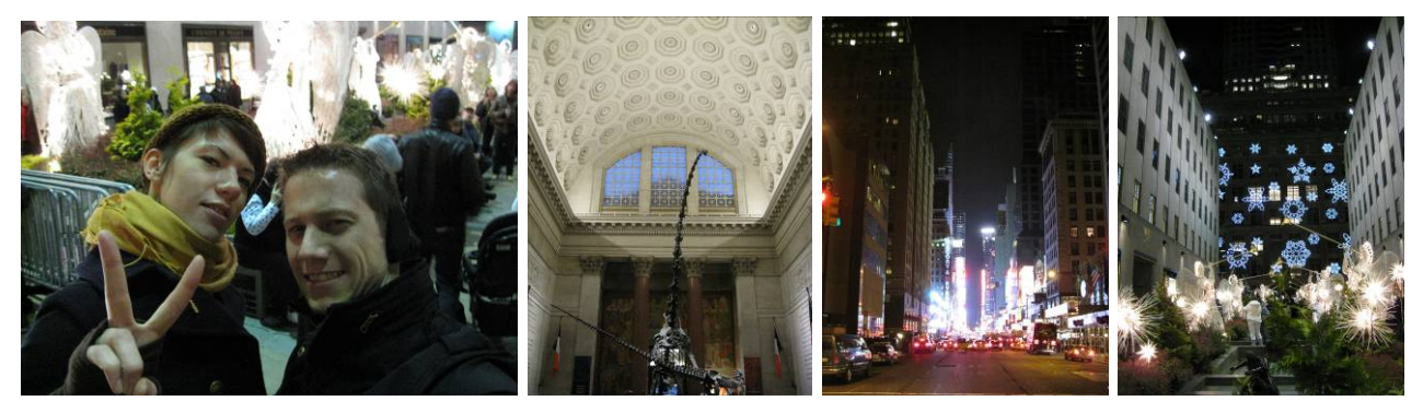
NY, exciting as usual. http://www.berndresch.com/pictures/0811_new_york/index.htm